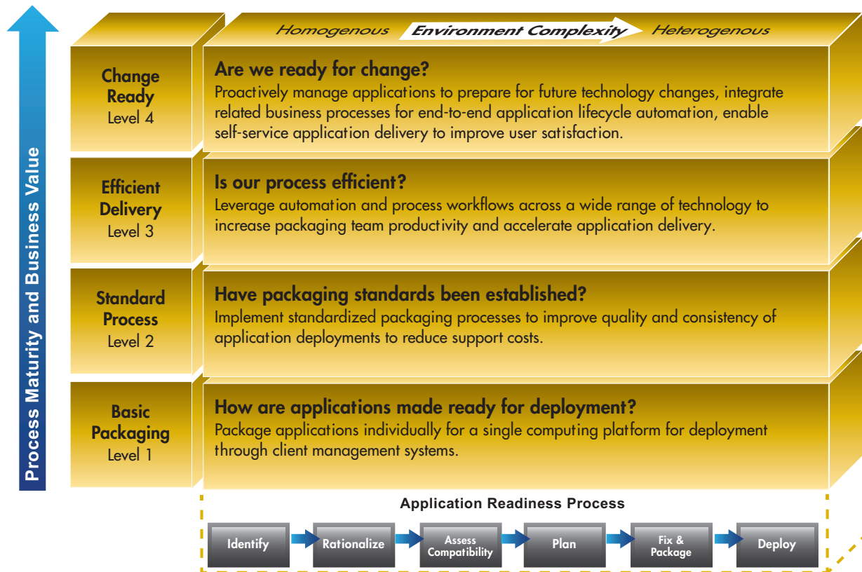
Figure 2: Application Readiness Maturity Model helps chart a path to higher levels of business value.